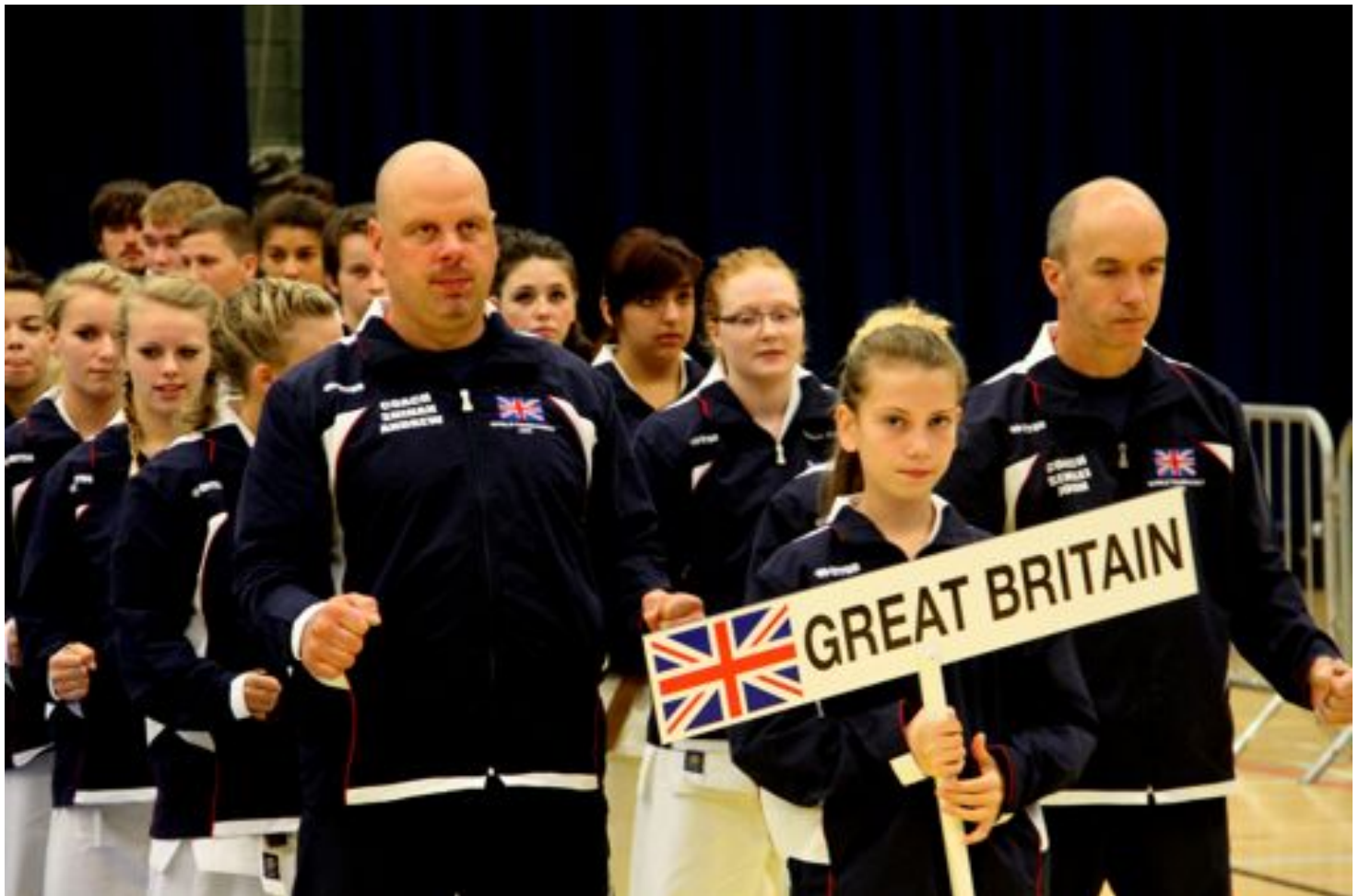
GB Squad at the IFK U18 World Tournament